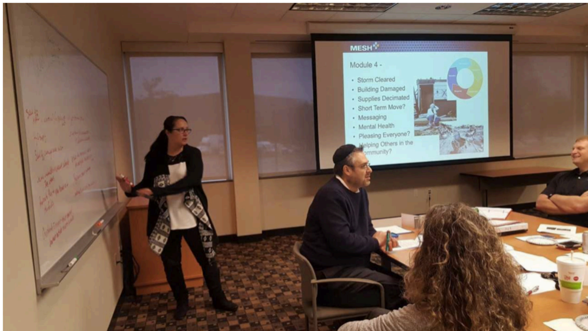
Staff of American Senior Communities participating in Tabletop Exercise.